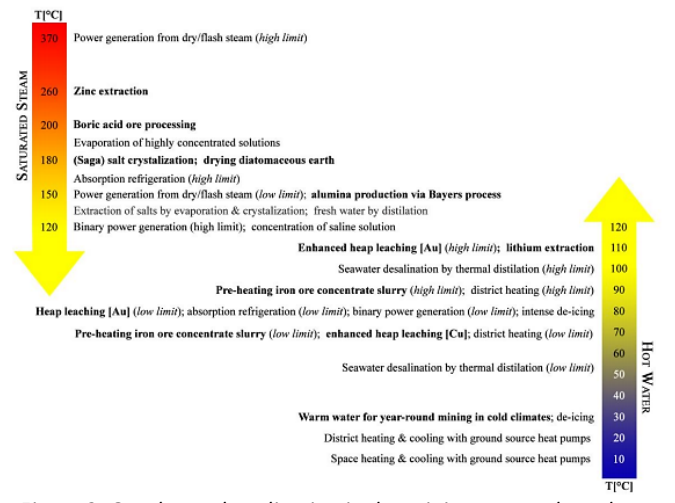
Figure 2: Geothermal application in the mining process based on temperatures